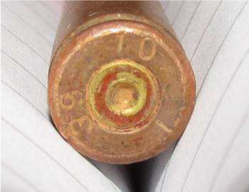
Matching 7.62x39mm ammunition cartridge case recovered from Mayom town market, 24 January 2012.