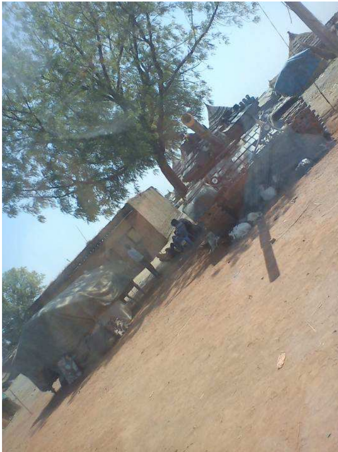
Left: T72M1 main battle tank in Mayom town, 24 January 2012.

“The SPLA brought a dabaab [tank] vehicle with machine guns and big gun. These ones were firing the shells.”