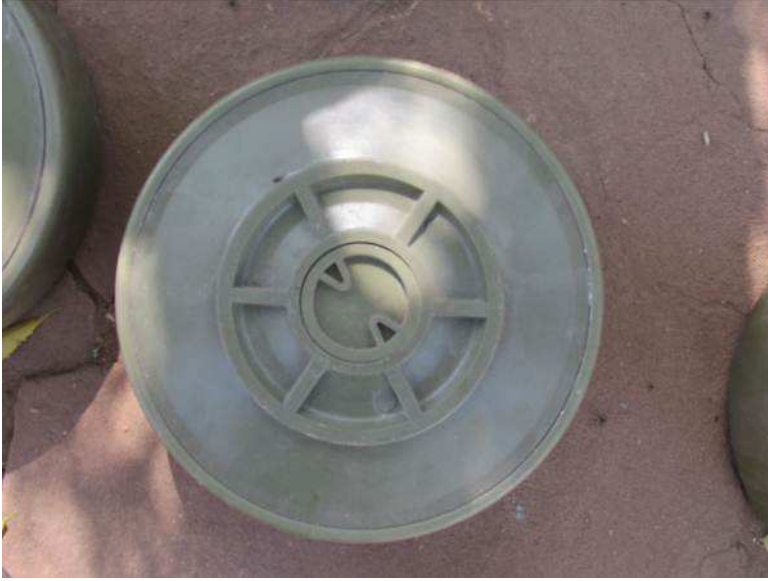
Type 72 anti-vehicle landmine reportedly seized from SSLA forces in Mankien during April or May 2011; photographed at SPLA headquarters, Rubkhona, Unity State, 27 January 2012. The same type has been recovered by international de-miners from roads elsewhere in Unity State during 2011.