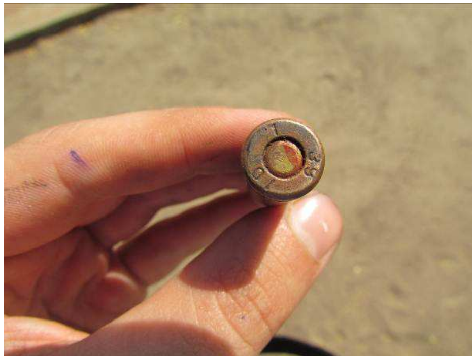
2010-manufacture Kalashnikov brass-cased ammunition (7.62x39mm calibre) loaded in Type 56-1 Kalashnikov-type assault rifles reportedly captured from SSLA forces in Mankien, viewed at SPLA 4th Division headquarters, Rubkhona, 27 January 2012.

captured from SSLA forces from Matthew Pul Jang's forces near Mankien, all of which were loaded uniformly with a single type of ammunition - new brass-cased cartridges whose markings indicate that they were manufactured in 2010. These differ significantly from (much older) SPLA ammunition also viewed by Amnesty International. 48 Identical brass-cased cartridge cases from the same manufacturer, year and lot were also recovered by Amnesty International in the marketplace of Mayom town, where fighting between SSLA and SPLA forces had taken place on 29 October 2011. All of the several dozen alleged rifles from Peter Gadet's forces also contained this particular type of ammunition, 49 and a former senior SSLA member confirmed that this appeared to match SSLA ammunition, although he denied that the older rifles were theirs. 50