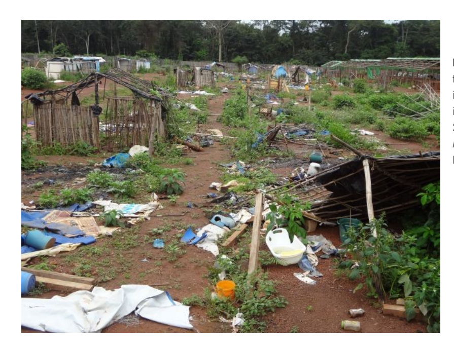
Nahibly Camp two months after its destruction. in September 2012.