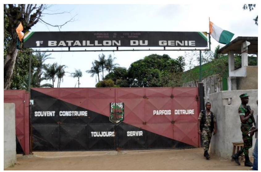
Génie Militaire (The Military Engineering Camp) in Abidjan.

Dozens of people were arrested by military police outside of any legal framework and detained at the headquarters of the military police, the Génie militaire (Military Engineering Camp), an unrecognized place of detention.