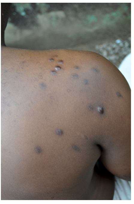
Burns from melted plastic on the bodies of former detainees in Abidjan.

The systematization of detention in unrecognized places of detention and incommunicado detention has facilitated the use of torture and other ill-treatment. A very large number of prisoners and former prisoners interviewed by Amnesty International described in detail the torture which they suffered and their coherent narratives show that these practices are essentially used to extract "confessions" but also to punish and humiliate individuals regarded as supporters of former President Gbagbo.