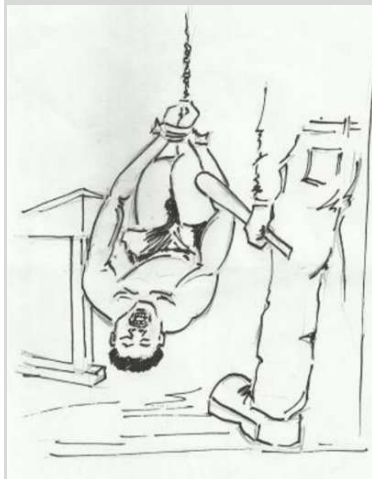
Figure 3 - An artist's drawing depicting a detainee being suspended upside down by their feet. © Chijioko Ugwu Clement