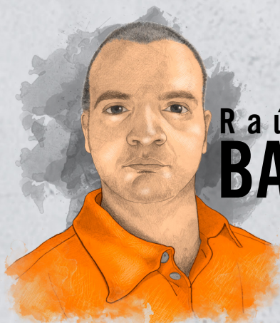
Raúl Emilio BADUEL

This can clearly be seen in the action of the courts and the staff of the Public Prosecutor's Office, such as, for example, temporarily halting the regular activities of the court in charge of the case; detaining people immediately following speeches by senior Venezuelan government officials indicating that a crime has been committed; and the lack of reasons given for some measures such as transfers and pre-trial detention, among others.